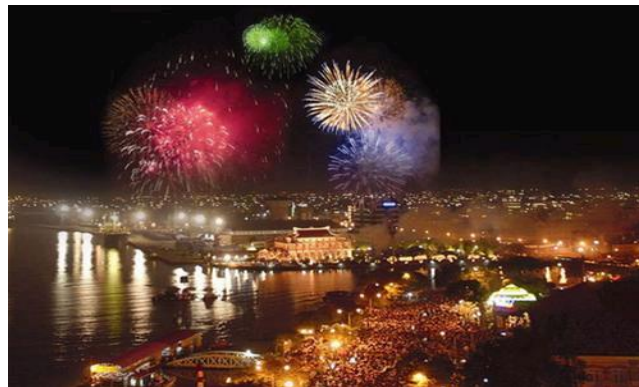
Firework on New Year Eve in Dist 1 near Ho Chi Minh Museum