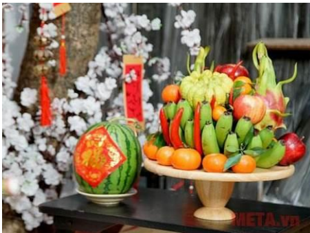
Fruit offering in the North include kumquats, bananas, oranges and Buddha hands.

Vietnamese families traditionally lay out a tray of 5 fruits at the altar called “Mâm Ngũ Quả”. The fruits are colorful and meaningful. Asian mythology, the world is made of five basic elements: metal, wood, water, fire and earth. The plate of fruits on the family altar at New Year is one of the several ways to represent this concept. It also represents the desire for good crops and prosperity.