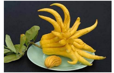
Quả Phật Thủ, (Buddah's Hand) fruit, considered good luck.