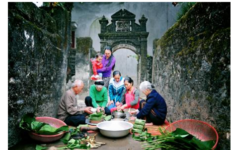
Preparing Bánh Chung for Tet