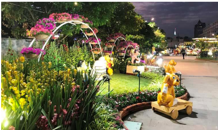
Flower Display on Nguyen Hue Street in Ho Chi Minh City