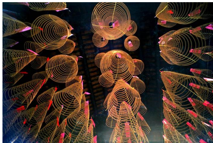
Burning incense in Chinese Temple District 5 (a piece of paper is attached to the incense, prayer writes name of the deceased or those who they are praying for).

Outdoor Entertainment will include lion dances, drum performances – the performances will take place in front of all major hotels in Dist. 1, (ie. Caravelle, Rex, Majestic, Grand, Continental, Kim Đô, Oscar, and Bông Sen, Palace Music, etc..) throughout February