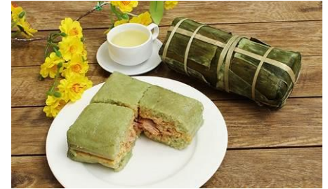
Bánh Chung and Bánh Tét

Thịt Kho Tàu : "Meat Stewed in Coconut Juice", a traditional dish of pork belly and medium boiled eggs stewed overnight in a broth-like sauce, often eaten with pickled bean sprouts and chives and white rice.