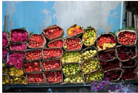
Ho Thi Ky Flower Market (open all year)

Similar to the pine tree for Christmas holiday in the West, Vietnamese also use many kinds of flowers and plants to decorate their homes for the holiday. Traditional plants include the Hoa Đào (Peach Blossom), Hoa Mai (Ochna Integerrima) and Cây Quất (Kumquat Tree). These plants represent coziness and prosperity. Other flowers may be displayed too.