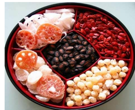
Mứt (dried fruit)