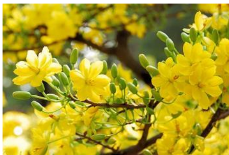
Hoa Mai (Ochna Intergerrima)

Hoa Đào (peach blossom) is more common in the North as it can grow in the dry and cold weather. It is used to ward off evil spirits during the Tết celebrations.