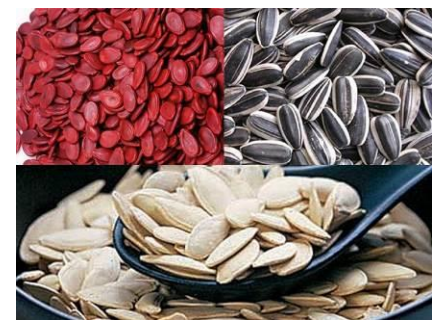
Hạt Dưa, Hạt Bí, Hạt Hướng Dương (roasted seeds).