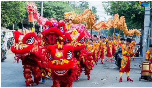
Events & Activities