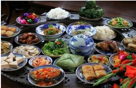
A typical meal offering to ancestors.

Vietnamese families traditionally lay out a tray of 5 fruits at the altar called “Mâm Ngũ Quả”. The fruits are colorful and meaningful. Asian mythology, the world is made of five basic elements: metal, wood, water, fire and earth. The plate of fruits on the family altar at New Year is one of the several ways to represent this concept. It also represents the desire for good crops and prosperity.