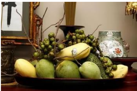
Fruit offering in the South include custard apples, coconuts, papayas, mango and goolar fig. In Vietnamese they are “Cầu, Dừa, Đủ, Xoài, Sung” which in the South

literally is a prayer to “have enough to use” in the New Year.