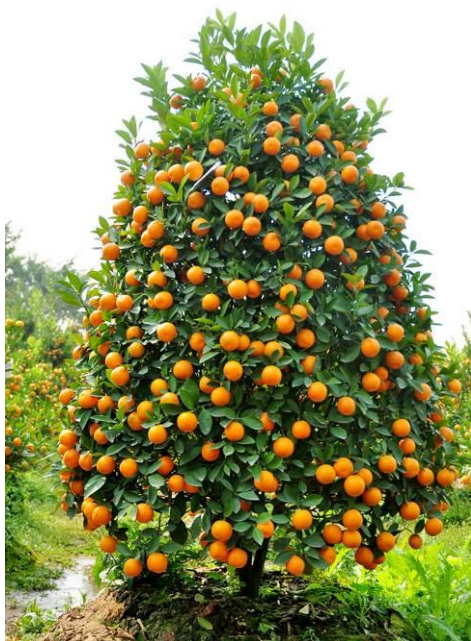
Cây Quất (Kumquat Tree)

Like a "family tree", the Kumquat plant symbolically represents the many generations of a household. The fruits are grandparents, the flowers are parents and the buds and green leaves are children. Kumquat plants are carefully selected for their symmetrical leaves, color and shape of fruit.