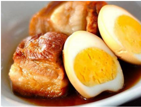
Thịt Kho Tàu (meat stewed in coconut juice)