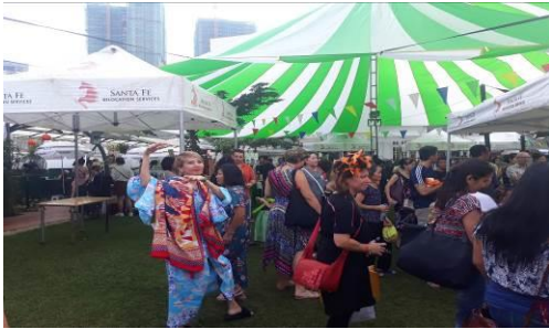
Santa Fe in the Community